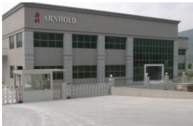
Our new marble processing plant in DongGuan enables us to grow strongly. 東莞新雲石加工廠房為集團發展建立了穩固基礎。

The Marble Export Division opened a new processing plant in DongGuan in 2006. The new facility has doubled our production capacity and we are growing strongly. We have established ourselves as a premier manufacturer of decorative stone products and have a strong customer base in the United States, United Kingdom, Australia, New Zealand, and the European Union.