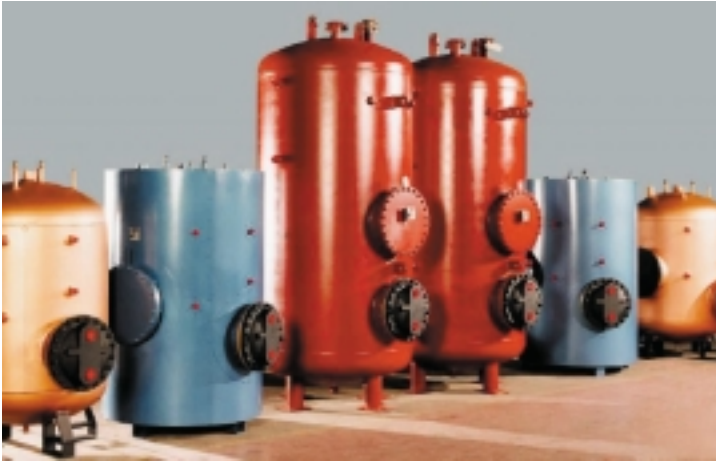
Arnhold's comprehensive range of Engineering Products ensure reliable building services.