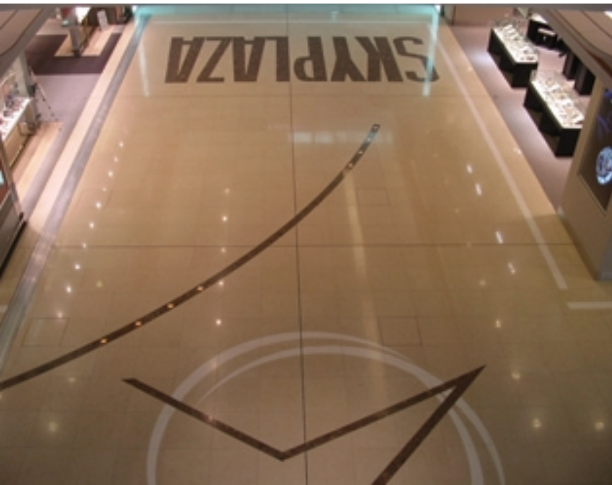
Patterned floors finished in conglomerate marble tiles supplied to Skyplaza.