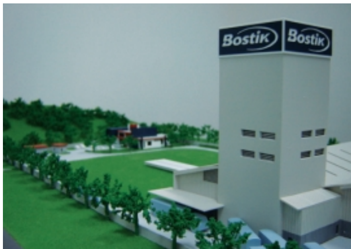
Arnhold team up with Bostik to bring world-class construction chemical plant to ZhuHai. 安利與 Bostik 合作於珠海開設世界級的建築化學物料廠房。

The Group has concluded a 40% JV with Bostik and we have commenced construction of an Adhesives Mixing Plant in ZhuHai. This will be the most advanced Powder Plant in China with completion targeted for end 2007. In the meantime we are establishing our sales and distribution network using imported products from other Bostik facilities in Asia.